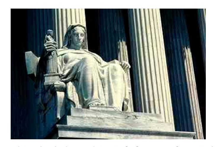
Statue of Justice in front of the U.S. Supreme Court Building